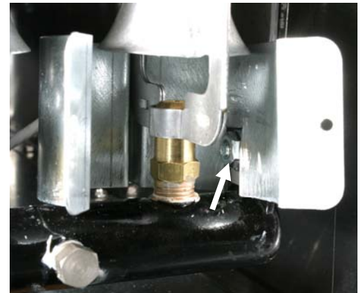
Figure 3: The flats on the manifold nut will need to be straight up to allow the outside left and right shutters to be positioned. See arrow.