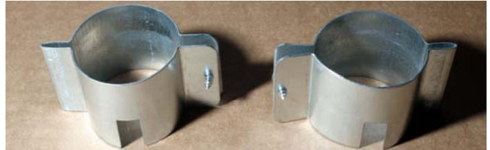
Figure 1: The shutters for the outside positions on the burner manifold are notched to accommodate the manifold mounting hardware. The shutters are positioned, left and right, above. The shutters are attached with the fastener in the front.